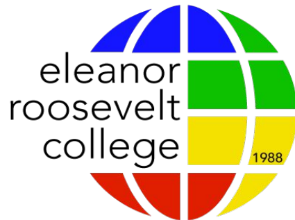
UC San Diego